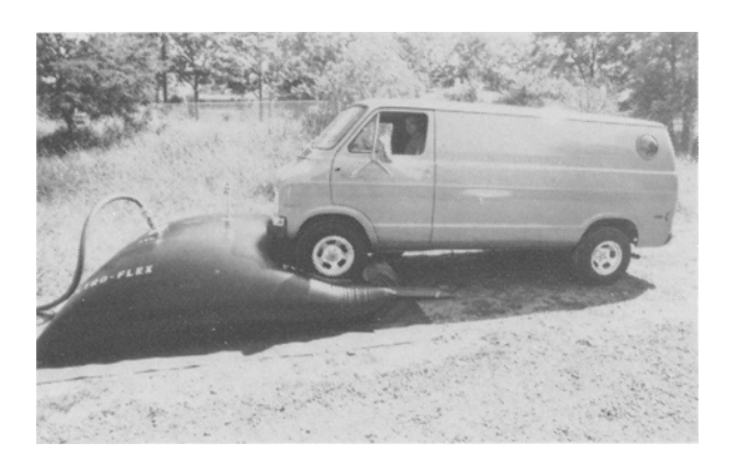
Petro Flex portable fluid container

P.O.S. Pilot Plant (P.O.S. represents protein, oil, and starch) is a nonprofit group established to construct and operate a pilot plant to aid development of new food technology on cereal grains, oilseed, and legumes.